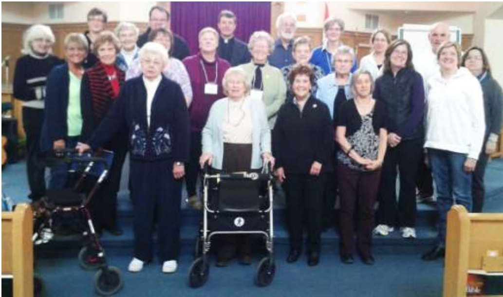
St. Margaret's Day Apart Group Photo April 5, 2014