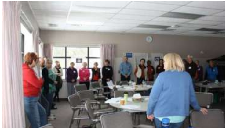
Where Are We in the Stages of Church Development?