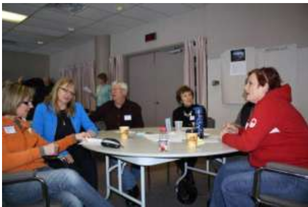
Thoughtful Table Discussion

This was an encouraging step in our journey as many of those present agreed to participate in a few smaller groups that will help to examine the data further and brainstorm some ideas to help us all move ahead into the future.